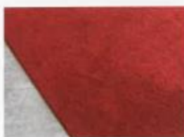
without tread border