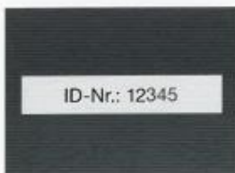
Inventory strips on reverse for owner identification purposes (Mat laundries)