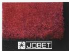
Tread border label tailored individually to the customer's wishes