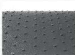
Nubs distributed over entire surface on back of mat